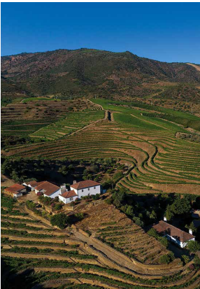
QUINTA DO VALE COELHO

2017 will be remembered as one of the hottest and driest years in the Douro. At Quinta dos Canais we had half the rainfall of an average year (just 246 mm) and temperatures broke several records during the spring. The summer was bone dry, just 6.2 mm recorded in June (monthly average: 24.3 mm), and not a single drop fell during July, August or September. It is quite extraordinary just how well-adapted our indigenous grape varieties are to the Douro's challenging conditions. Fortunately, summer temperatures provided some respite – they were slightly below the 30-year average. This was critically important; if the lack of rain had been combined with extreme temperatures, the outcome could have been very different.